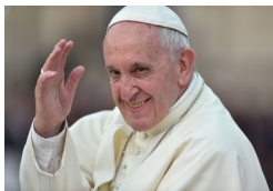
ANGELUS ROME JANUARY 17, 2021

May the Virgin Mary help us make our lives a hymn of praise to God in response to his call and in the humble and joyful fulfillment of his will. But let us remember this: there was a moment in each of our lives in which God made himself present more strongly, with a call.